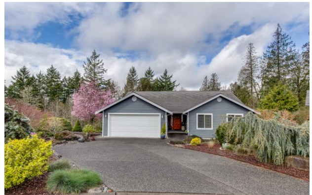
1319 Lena Pl. (available)