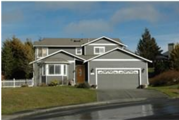
1386 Amber Ct. (pending)